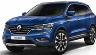
ADMIRAL BLUE (2)