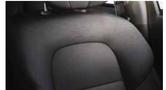
INITIALE PARIS MIDNIGHT BLACK NAPPA LEATHER UPHOLSTERY

AGAPI - 18" alloy wheels GALIKI - 19" alloy wheels INITIALE PARIS - 19" alloy wheels