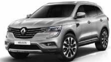
STINGRAY SILVER (2)