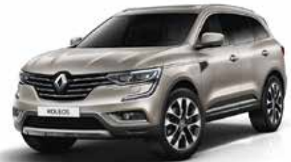
NOMAD BEIGE (2)