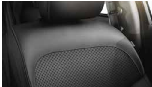
CARBON BLACK SYNTHETIC LEATHER AND CLOTH UPHOLSTERY