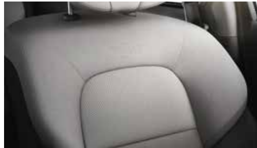
INITIALE PARIS TWO-TONE NAPPA LEATHER UPHOLSTERY