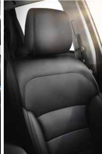
Carbon Black leather upholstery†