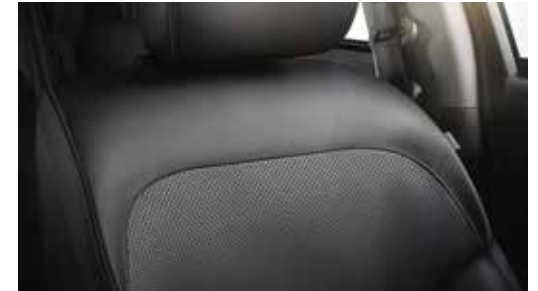
CARBON BLACK PART LEATHER UPHOLSTERY*