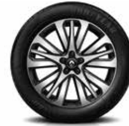
19" INITIALE PARIS