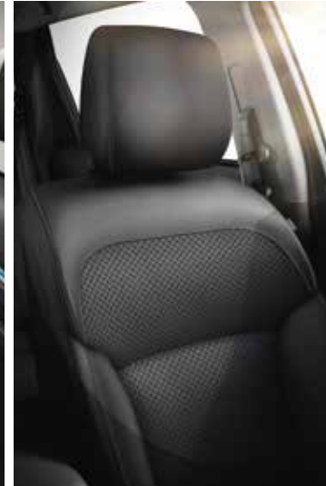
Synthetic leather and cloth upholstery