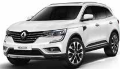
FRESCA WHITE (1)