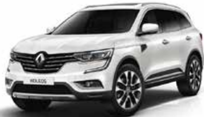
UNIVERSAL WHITE (2)