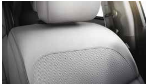
SILVER GREY PART LEATHER UPHOLSTERY*