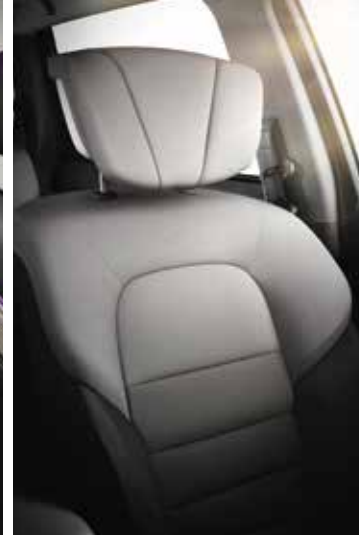
INITIALE Paris two-tone nappa leather upholstery