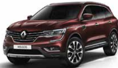
MULBERRY RED (2)