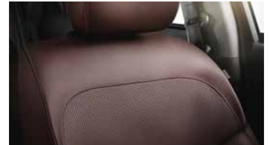
SIERRA BROWN PART LEATHER UPHOLSTERY*