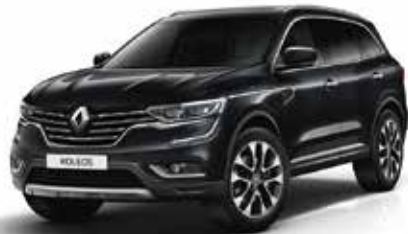
DUSKY BLACK (2)